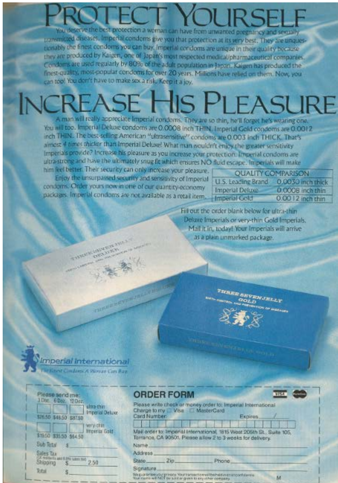
Figure 3. Imperial condom advertisement