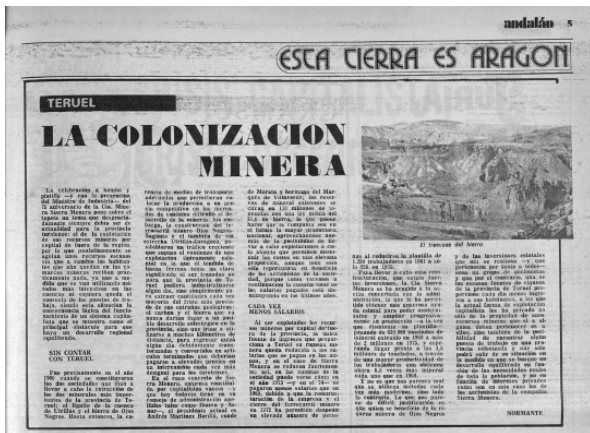
Figure 1: "Mining colonization" described by Biescas Ferrer. Source: Andalán , num. 76, 1 November 1975, p. 5.