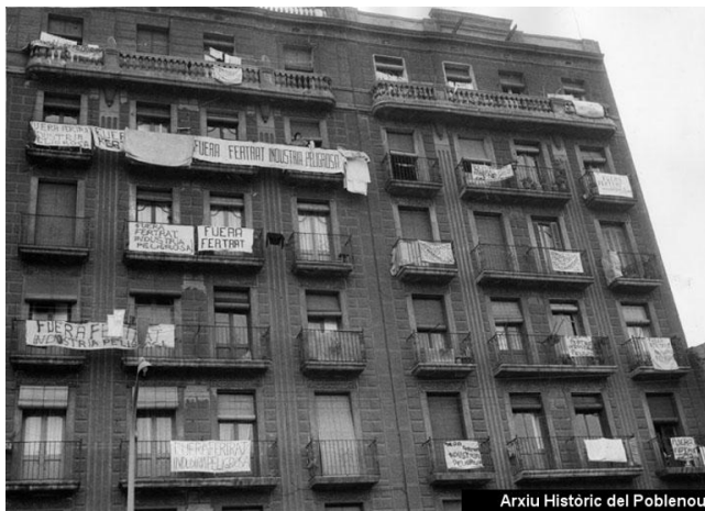
Figure 3: Protest against Fertrat chemical industry (Poble Nou, Barcelona 1975).

for pines every week, on every three-day weekend". 21 In Barcelona, in the districts of Poble Nou, Nou Barris, Horta, and El Carmelo, neighborhood communities fought in vain against chemical industries and speculation projects (Figure 3). 22 In the Valencian working landscape, there was a struggle over access to nature and outdoor recreation around El Saler and La Albufera (Hamilton, 2018). The working-class districts of Murcia and Seville, Carmona, Jaen, Granada, and Huelva also reclaimed green spaces and fought for the monitoring of industrial and air pollution and better environmental conditions (Escudero Andújar 2007; Pérez Cebada 2015; Contreras Berra 2018). In peripheral communities from north to south, a link emerged between environmental security inside and outside the factories that were placed close to workers' housing. In 1972, the Manifest for Aragón's Communist Party asserted: "In Spain, Aragón definitely has what we could call, without any kind of exaggeration, an internal colonization situation, which will lead inexorably to the economic, social and political degradation and the fall of our region". 23