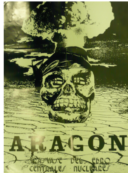
Figure 4: AEORMA's poster against nuclear plants and the Ebro River transfer.

were severely criticized, and the backlash against them was considered an anti-imperialism struggle because of the financial aid and support they received from the United States and West Germany (Figure 4). In Aragón, Galicia, Basque Country and Catalonia, the opposition to these nuclear power stations was led by local communities called "antinuclear committees". Democratic coordinating committees organized maydays, festivals and anti-nuclear marches. From 1975 to 1977, rural and urban actions against nuclear projects were also supported by the Democratic Coordination committee, which claimed a "democratic management of natural resources" to respond to pillaging and plundering. 24