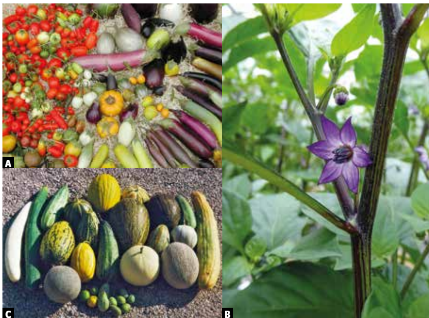
■ Figure 1K. A. An example of the fruit diversity of Solanum melongena (eggplant) and related species maintained at the "CRB-Leg". Credit: CRB-Leg. B. A pepper ( Capsicum ) flower from one of the accessions of the Capsicum collection maintained by the BRC "CRB-Leg". Credit: CRB-Leg. C. An example of melon ( Cucurbitaceae ) fruit diversity in the collections of the "CRB-Leg". Credit: CRB-Leg.

sions through the INRAE database ( https://urgi.versailles.inra.fr/siregal/siregal/grc.do ). This database contains passport data and descriptions of each accession. It is linked to other databases such as Florilège (national database) and Eurisco (European database). The duty of the BRC-Leg is to carry out morphological descriptions in the open field or in greenhouse. Historically, this activity has mostly included traits related to the harvested product (fruit or leaves). Evaluation has so far typically focused on resistance to pathogens and fruit quality. GAFL scientists are developing research programs to include root traits in the plant descriptions. Both the patrimonial collections and the scientific genetic resources (segregating populations, mutants, etc.) of the BRC-Leg are used for research topics currently including: salt resistance in tomato (ERA-NET root project,