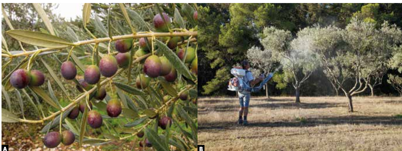
■ Figure 1E. A. Turning color olives of ‘Petit Ribier’ cultivar. B. Organic clay treatment against the fly Bactrocera olea in the French national collection located in the Parc National de Port-Cros Porquerolles.