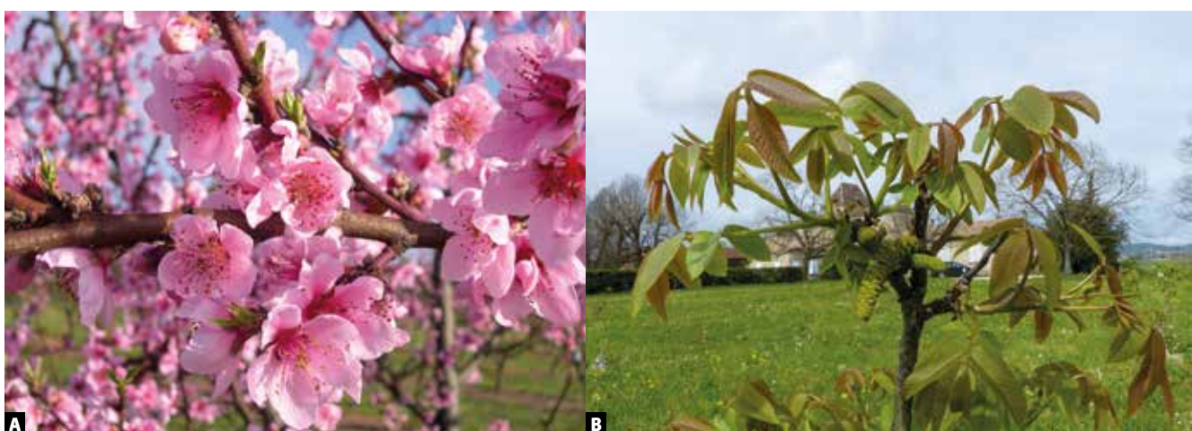
■ Figure 1F. A. Flowering Prunus from the Rose-pom collection. Credit: BRC Rose-pom. B. Flowering of walnut in new plantation. Credit BRC Prunus-Juglans .

physiology in a research project developing plant hormonal compounds in goat breeding.