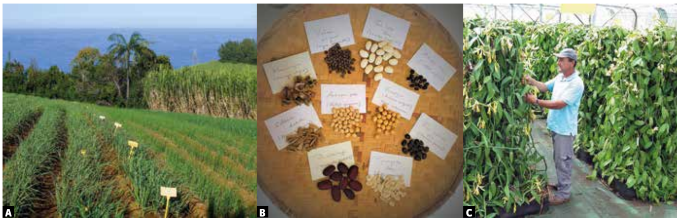
■ Figure 1J. A. Field maintenance of the garlic collection at a farm in Petite Ile (Reunion Island). B. Display of the diversity of vegetable seeds for educational purposes. C. Maintenance of the vanilla collection under insect-proof shade-house.