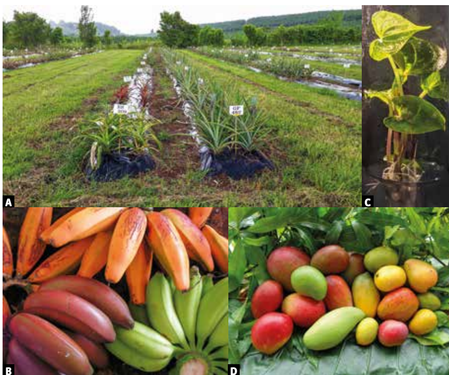
■ Figure 1. A. Pineapple field collection in Martinique. Credit: M. Roux-Cuvelier. B. Diversity of banana fruit. Credit: BRC Tropical Plants. C. In vitro plantlet (yam collection). Credit: M. Roux-Cuvelier. D. Diversity of mango fruit. Credit: BRC Tropical Plants.

species. Seventy percent of the genotypes come from Africa. Recently enriched with heritage varieties from the French Caribbean Islands, this collection is used to diversify mango production.