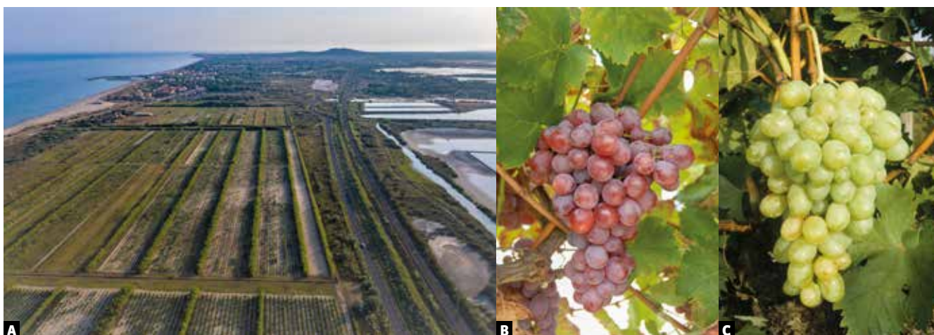
■ Figure 1D. A. Domaine de Vassal, field collection. Credit: C. Cruells. B. 'Italia Rubi' cultivar. Credit: BRC Grapevine. C. 'Malaga' cultivar. Credit: BRC Grapevine.

which brings together 36 professional partners from all wine-producing regions. The common database for this network is https://bioweb.supagro.inra.fr/collections_vigne/Home.php .