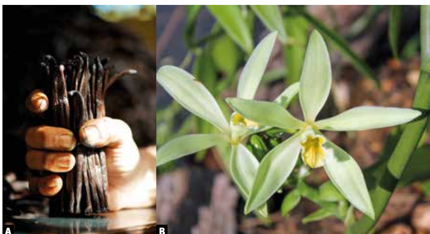
■ Figure 1H. A. Cured beans of Tahitian vanilla. B. Tahitian vanilla flower.

The mango collection is a historical CIRAD collection. It comprises 120 accessions kept in the field, mainly of the Mangifera indica