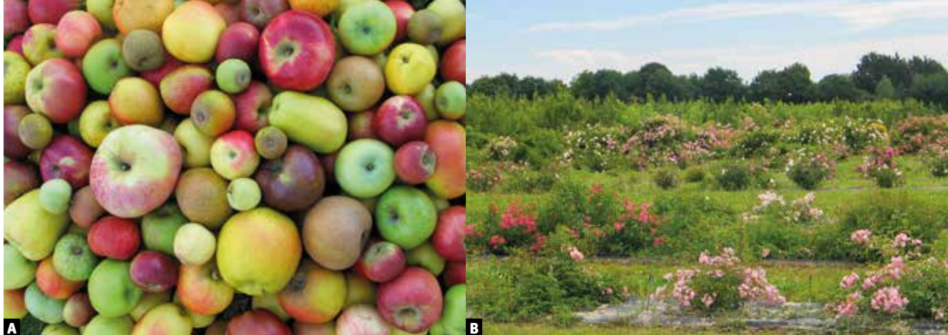
■ Figure 1G. A. An overview of the different colors and fruit shapes of the apple varieties conserved in the BRC RosePom. B. Scientific genetic resource collection of Rosa at INRAE, Beaucouzé, France.

enies present in the BRC RosePom fields are the support of several quantitative trait loci studies on different traits, including scent of roses, prickle and disease resistance. Other projects on rose diversity such as those on Rosa gallica , or the RosesMonde project (2015-2019) highly contributed to enrich the DNA collection of the BRC RosePom.