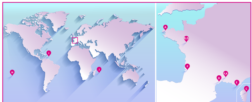
■ Figure 1. Localization of the 11 French Biological Resource Centers (BRCs) around the globe. Left: overseas BRCs, right: mainland France and Corsica BRCs. A = BrAcYSol, B = Carrot and other vegetable Apiaceae , C = Citrus, D = Grapevine, E = Olive trees, F = Prunus-Juglans , G = Rose-Pom, H = Tahitian vanilla, I = Tropical plants, J = Vatel, K = Vegetables. (Figure designed by M. Duportail, CIRAD).

The Florilège portal ( http://florilege.arcad-project.org/fr/collections ) provides a focal point for web entry into the biological resources of plants for agriculture conserved in France (metropolitan and overseas). In its