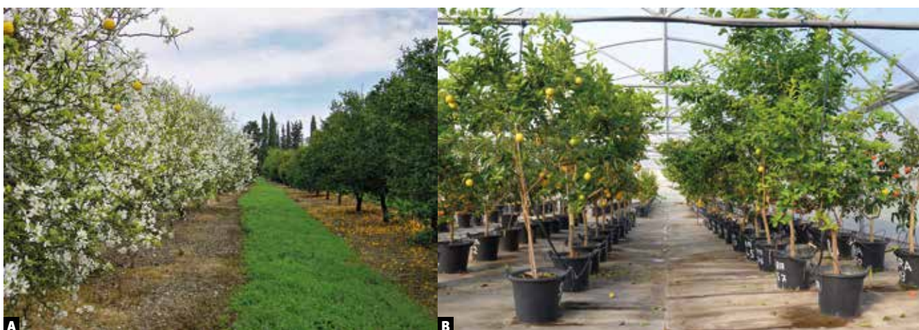
■ Figure 1C. A. Citrus field collection. B. Greenhouse citrus collection.

In addition to identifying the ancestral species at the origin of cultivated citrus, this information opens the way to new strategies for breeding based on a wide exploitation of the genetic resources of the species complex to generate the genotypes of tomorrow.