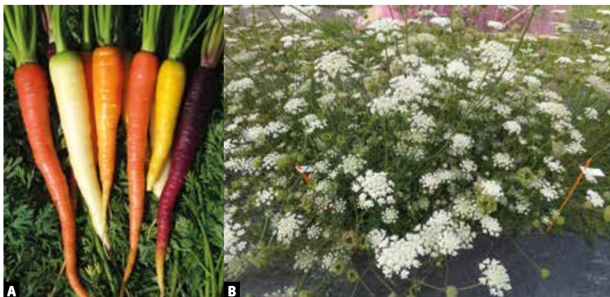
■ Figure 1B. A. Diversity of carrot root color. Credit: E. Geoffriau. B. Wild carrot umbels for seed regeneration. Credit: E. Geoffriau.

Bailleul, Porquerolles, Corsica) and a taxonomy expert (Via Apia). At European level, the BRC Carrot and other vegetable Apiaceae is the French representative on the ECPGR working group Umbelliferae (coordination 2008-2013), and is involved in ECPGR Carrot Diverse and EVA carrot projects. It coordinates collecting missions.