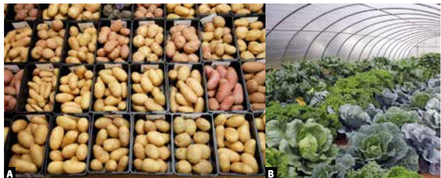
■ Figure 1A. A. Diversity of potato varieties. B. Diversity of cabbage populations.

The BrACySol BRC coordinates three national networks for the conservation of plant