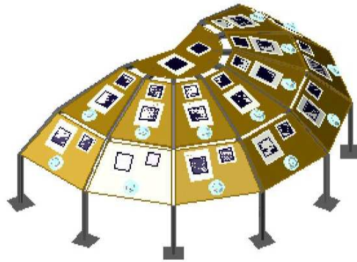
Fig. 1: Semi-hemispherical structure