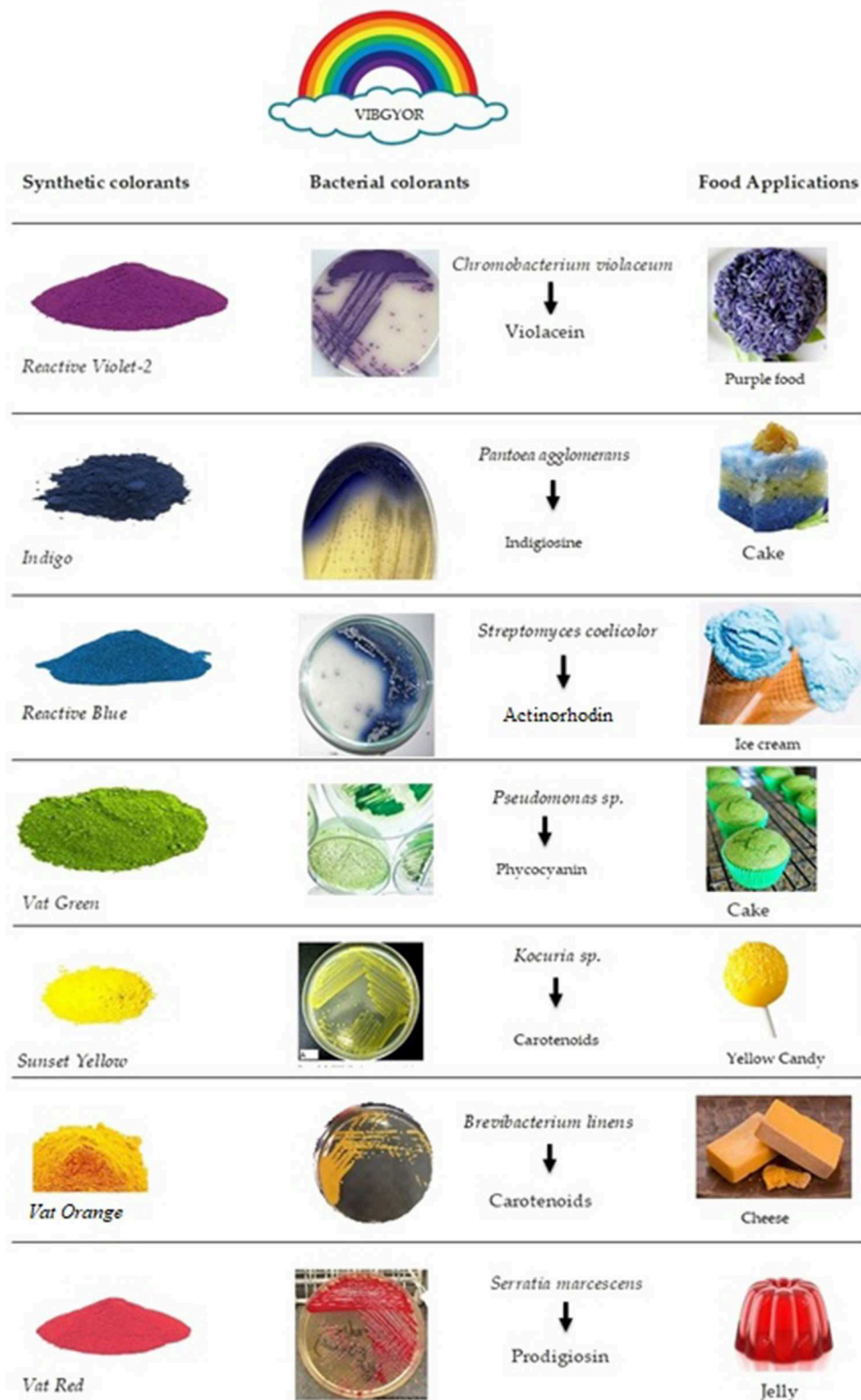
TABLE 2 | Rainbow (VIBGYOR) colorants possible with bacterial pigments.

VIBGYOR (Violet-Indigo-Blue-Green-Yellow-Orange-Red) is a popular mnemonic device used for memorizing the traditional optical spectrum.