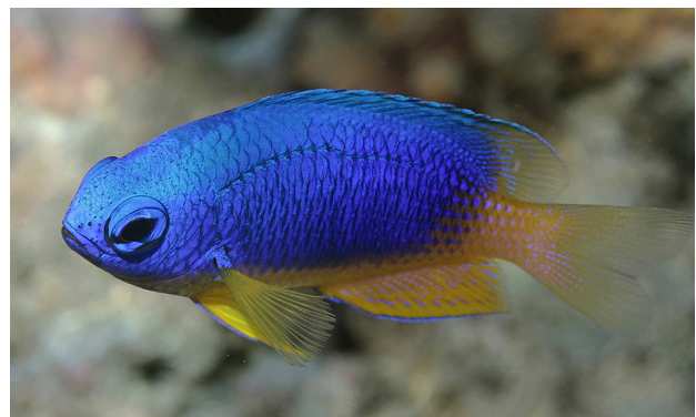
Fig. 2. Pomacentrus caeruleus ; individual photographed at Reunion, ca. 3 cm SL