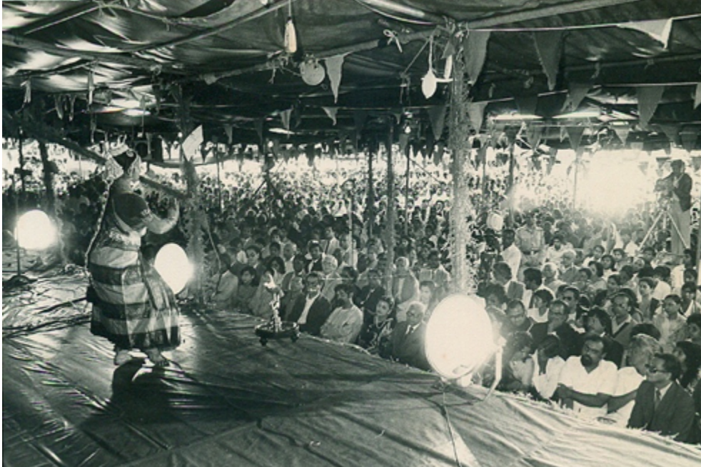
Fig. 6 - A dance performance in the evening celebration, 1983