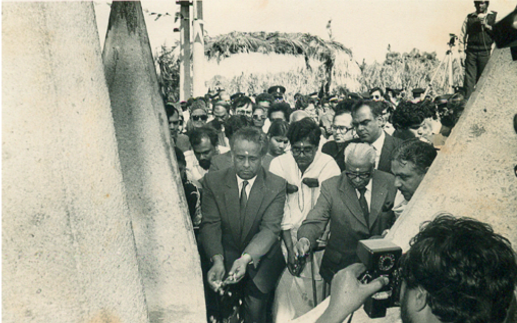
Fig. 4 - The Inauguration ceremony, 2 nd September 1983