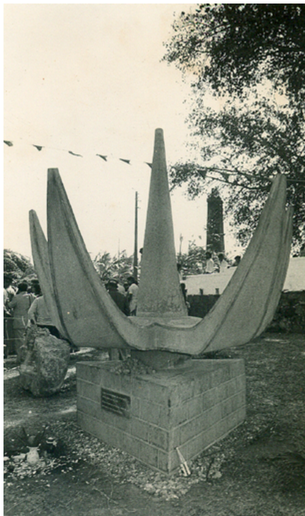
Fig. 8 - Phooliyar Monument with the view of the chimney of Antoinette sugar estate 1983

her drawings of the chimney; then she composed it in-between the petal forms and create an illusion of a blooming floral sculpture; after that it visually jagged through photograph. Her desire was to create an impression of the chimney of the sugar factory not only through the monument, but also through the photographs. Mala explored the visual reasoning of photography that she learned from the history of indenture labour photo as well as her academic training at the art schools.