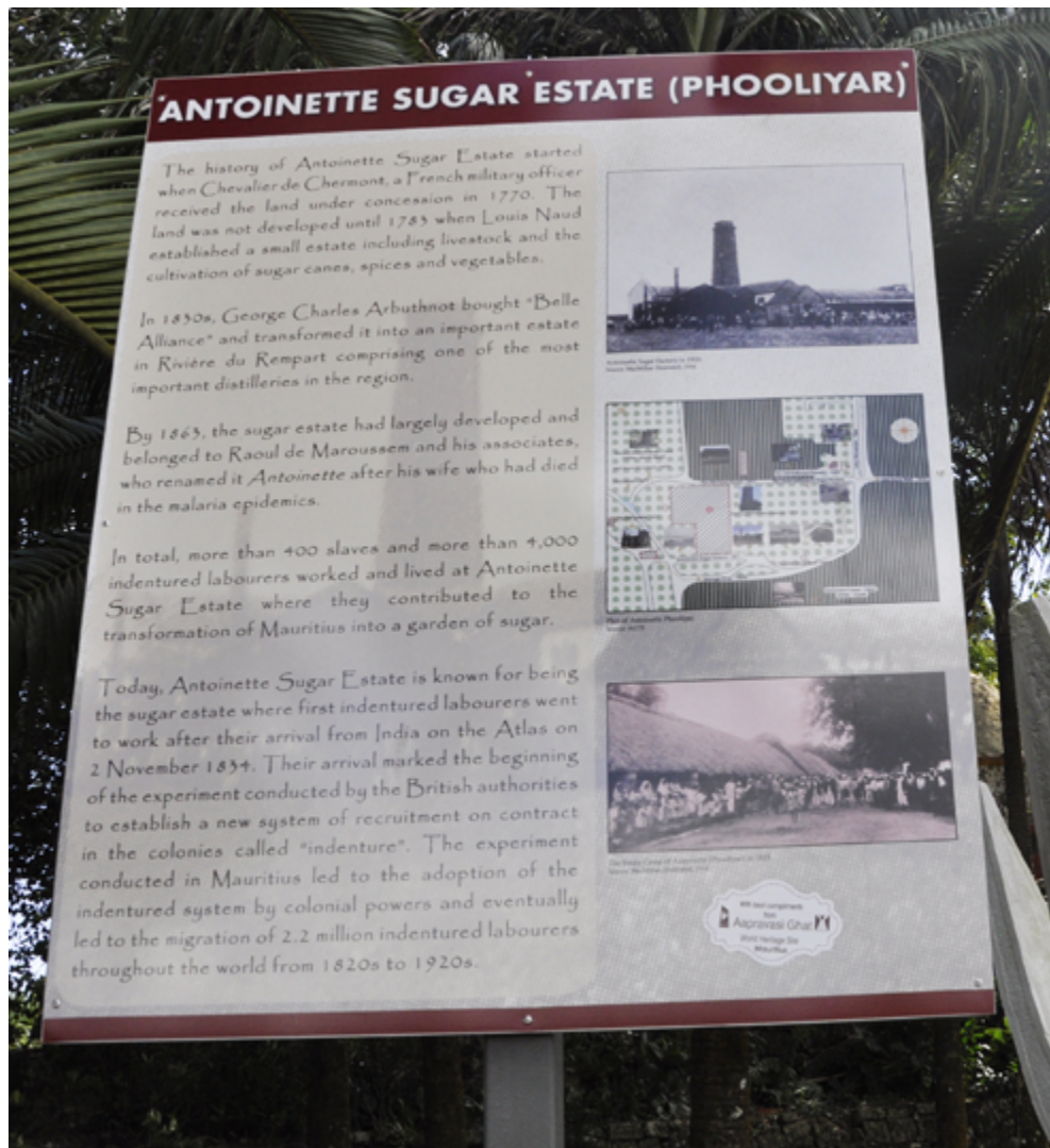
Fig. 2 - The Information board, 2018