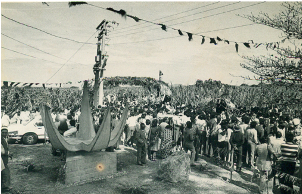
Fig. 5 - Gathering on the inauguration day, 2 nd September 1983