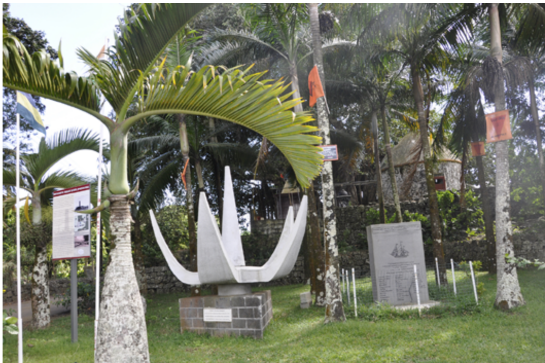
Fig. 1 - Phooliyar Monument, 2018