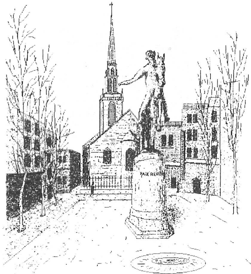
Paul Revere's statue and Old North Church