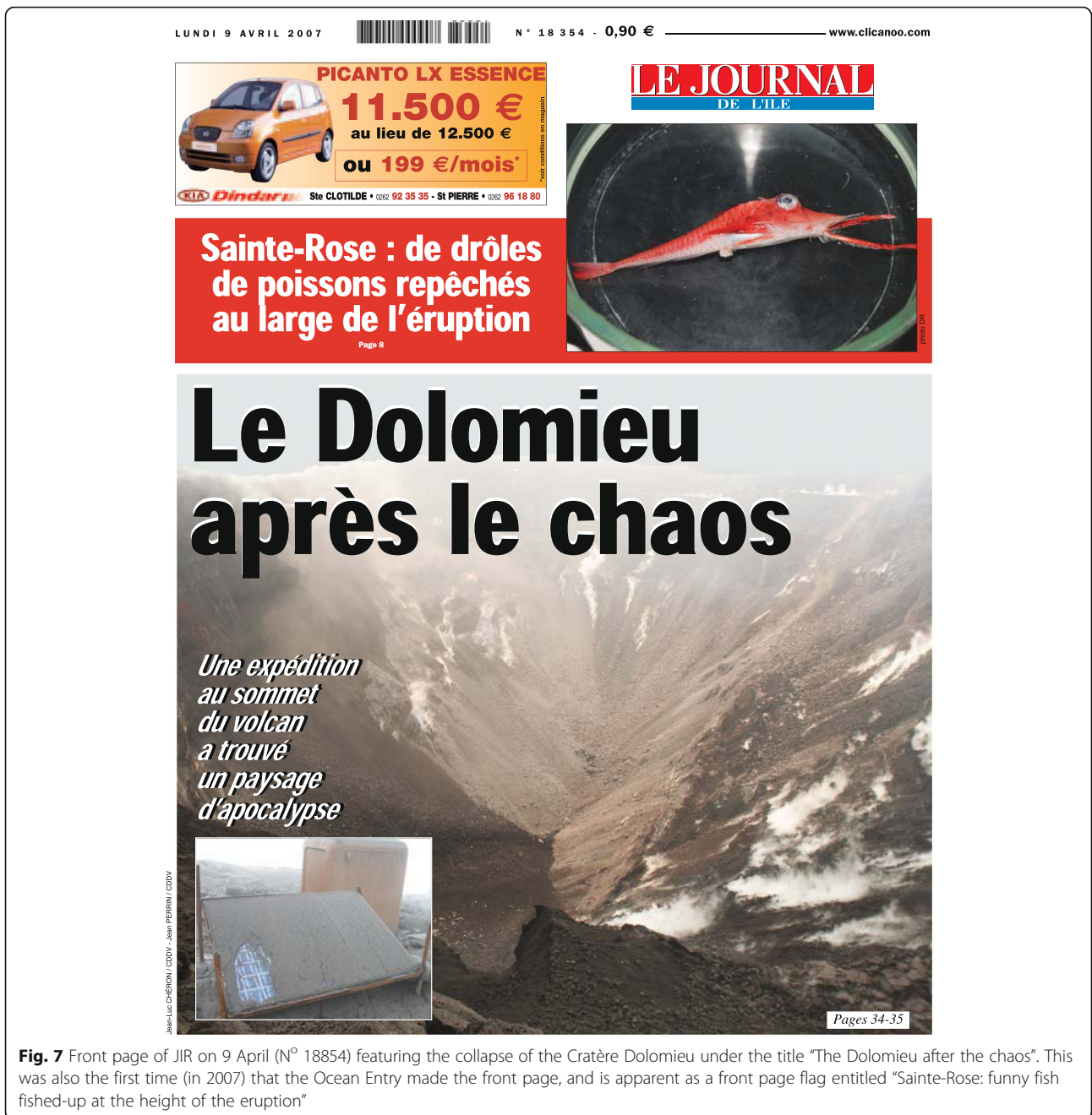
Fig. 7 Front page of JIR on 9 April (N° 18854) featuring the collapse of the Cratère Dolomieu under the title “The Dolomieu after the chaos”. This was also the first time (in 2007) that the Ocean Entry made the front page, and is apparent as a front page flag entitled “Sainte-Rose: funny fish fished-up at the height of the eruption”

entry on 3 and 4 April, respectively. Focus then switched to gas and air fall on 5 and 6 April, respectively, before becoming entirely focused on the collapse of the Dolomieu (on 7, 9, 11, 13 and 22 April). This was in spite of the fact that the main collapse occurred on 6–7 April, but ocean entry and lava flow continued throughout the eruption. The threat of lava flow invasion to Le Tremblet only became a focus again on the final front page that featured the eruption, that of 27 April, when the eruption had more-or-less ended. Thus, the reporting of hazard followed the primary