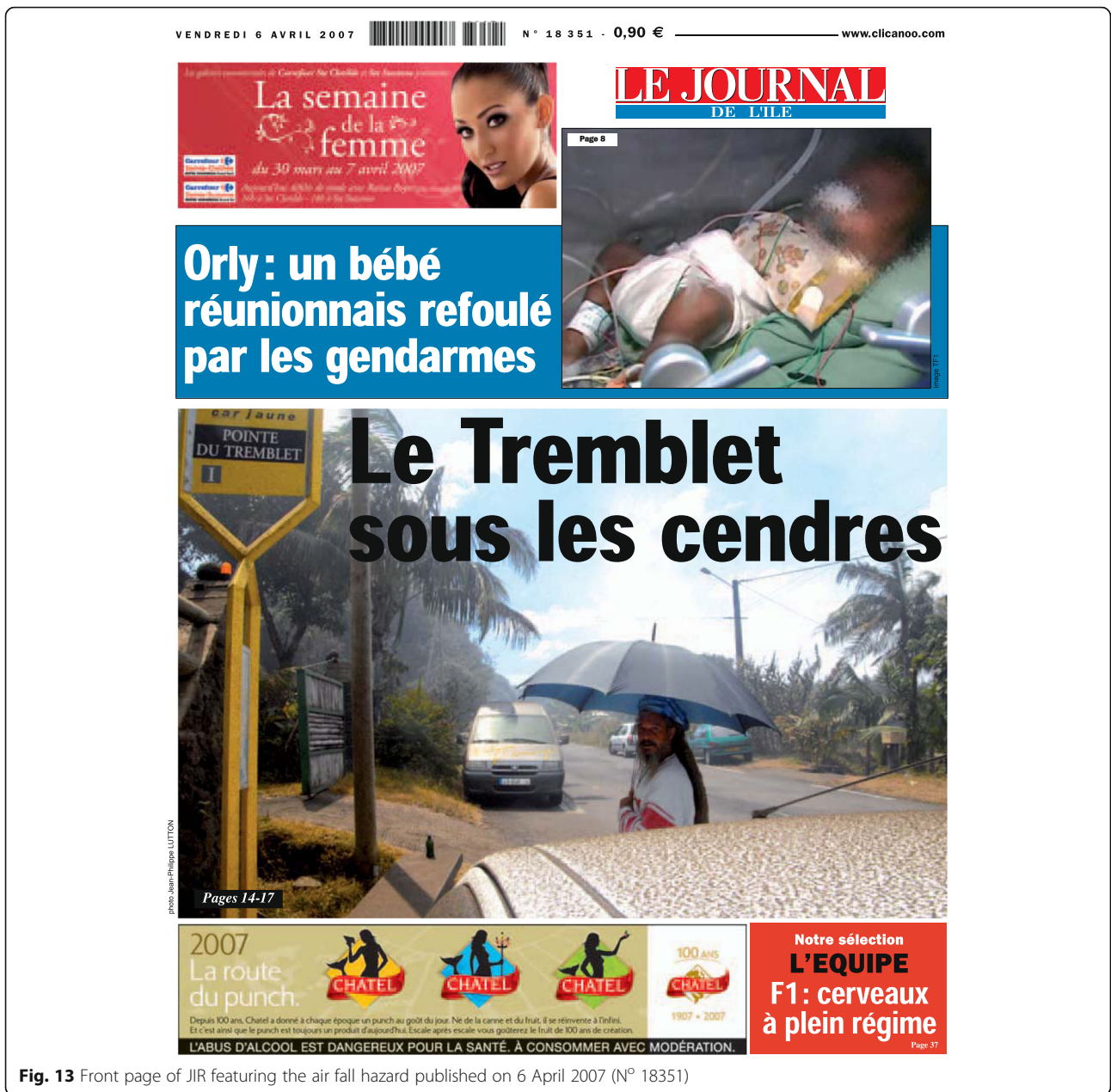
Fig. 13 Front page of JIR featuring the air fall hazard published on 6 April 2007 (N° 18351)

town center and my car was covered” (Leyral 2007c), embodied the problem of framing this hazard. That is, it was framed in terms of the victims, and not the responders or decision makers. Indeed definition of, and ad-hoc responses to, the air fall hazard were spontaneous and developed by those subject to the hazard. For example, Leyral (2007b) reported,