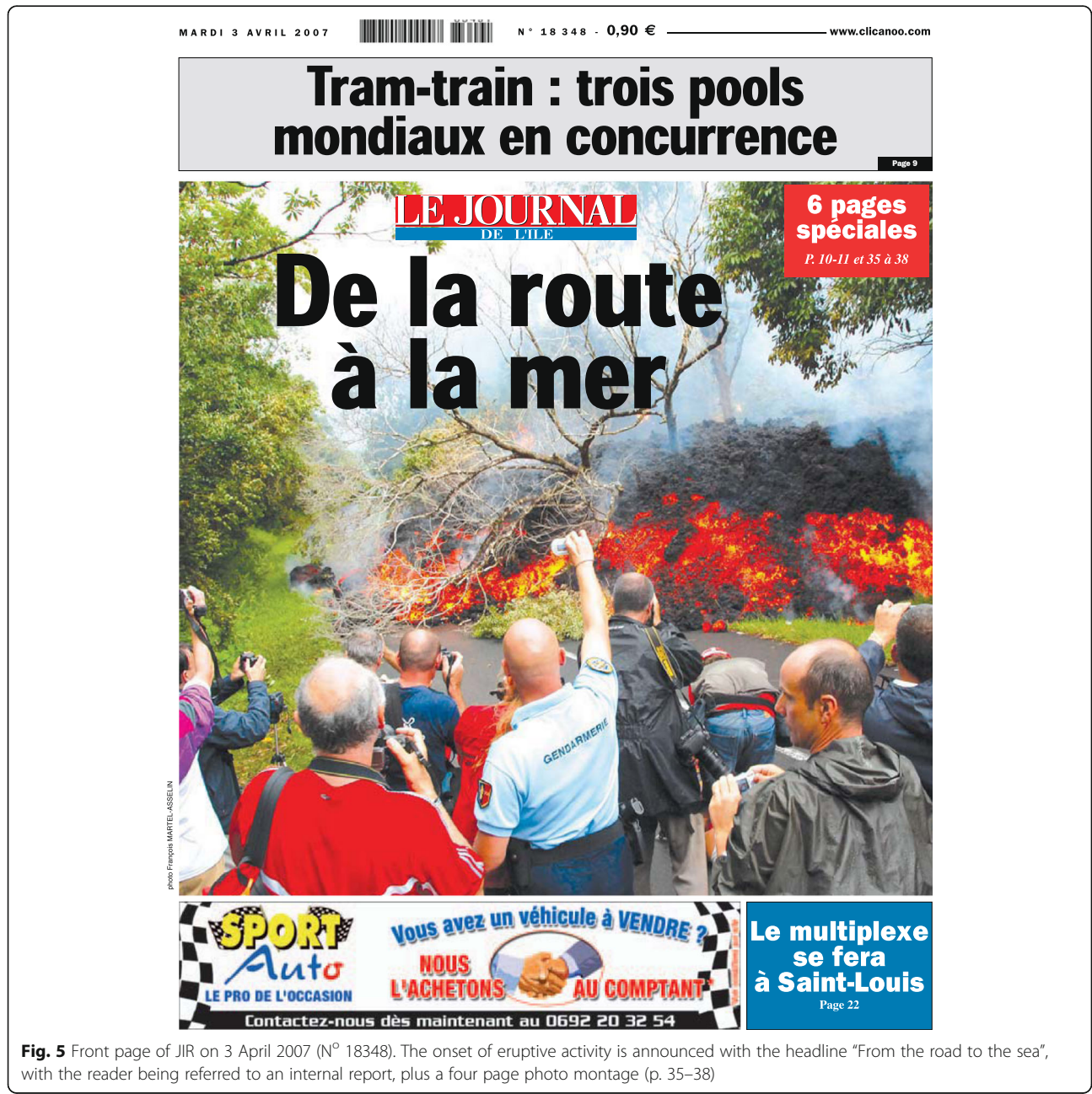
Fig. 5 Front page of JIR on 3 April 2007 (N° 18348). The onset of eruptive activity is announced with the headline “From the road to the sea”, with the reader being referred to an internal report, plus a four page photo montage (p. 35–38)

By number of front pages carrying volcanic hazard as the main theme, the collapse events of the Cratère Dolomieu