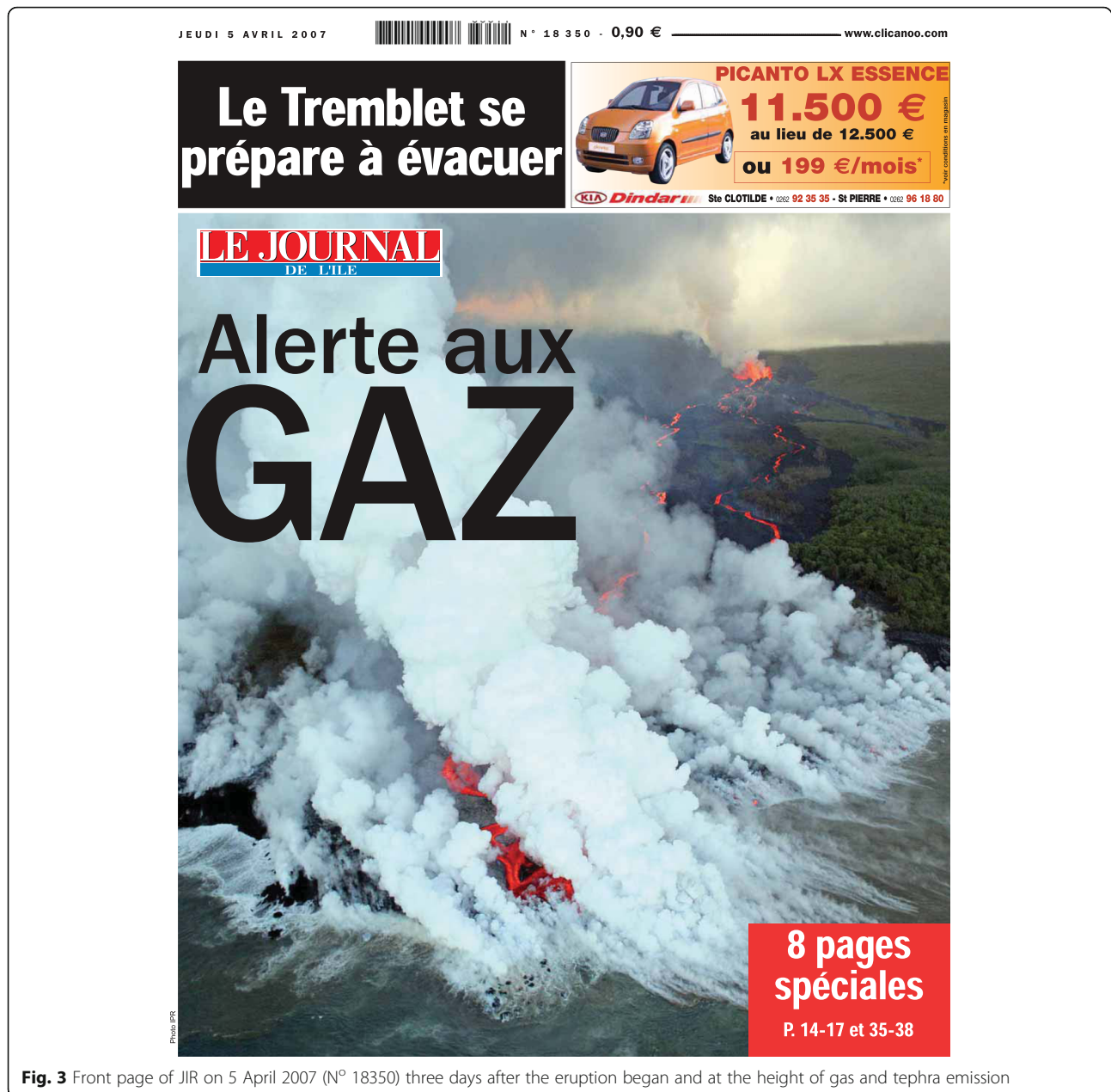
Fig. 3 Front page of JIR on 5 April 2007 (N° 18350) three days after the eruption began and at the height of gas and tephra emission