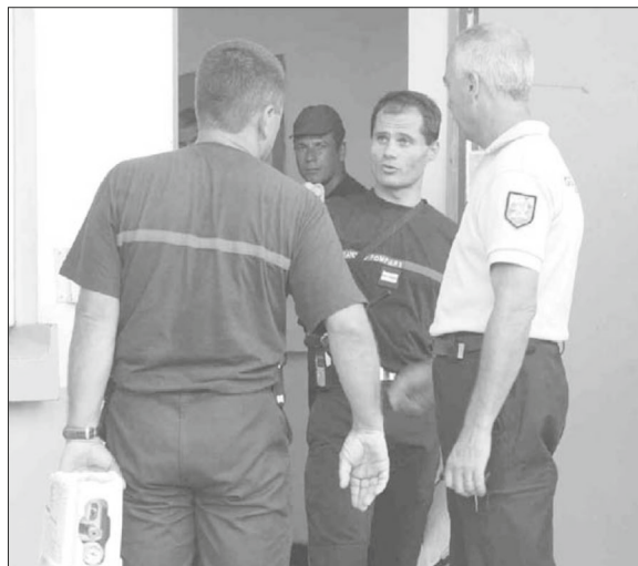
Pas moins de vingt-cinq pompiers de tout le Sud ont été mobilisés sur ce phénomène très localisé à Saint-Joseph.