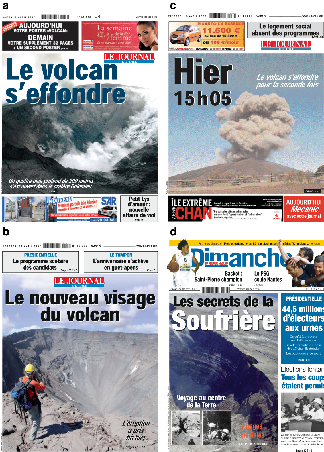
Fig. 10 Front pages of JIR featuring pit-crater collapse published on (a) 7 April 2007 (N° 18352), (b) 11 April 2007 (N° 18356), (c) 13 April 2007 (N° 18358), and (d) 22 April 2007 (N° 18367)