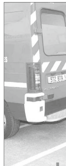
Entre le lycée Pierre-Poivre et les collèges Sang-Dragons et Joseph Hubert quatorze élèves ont été évacués vers l'hôpital par les secours.