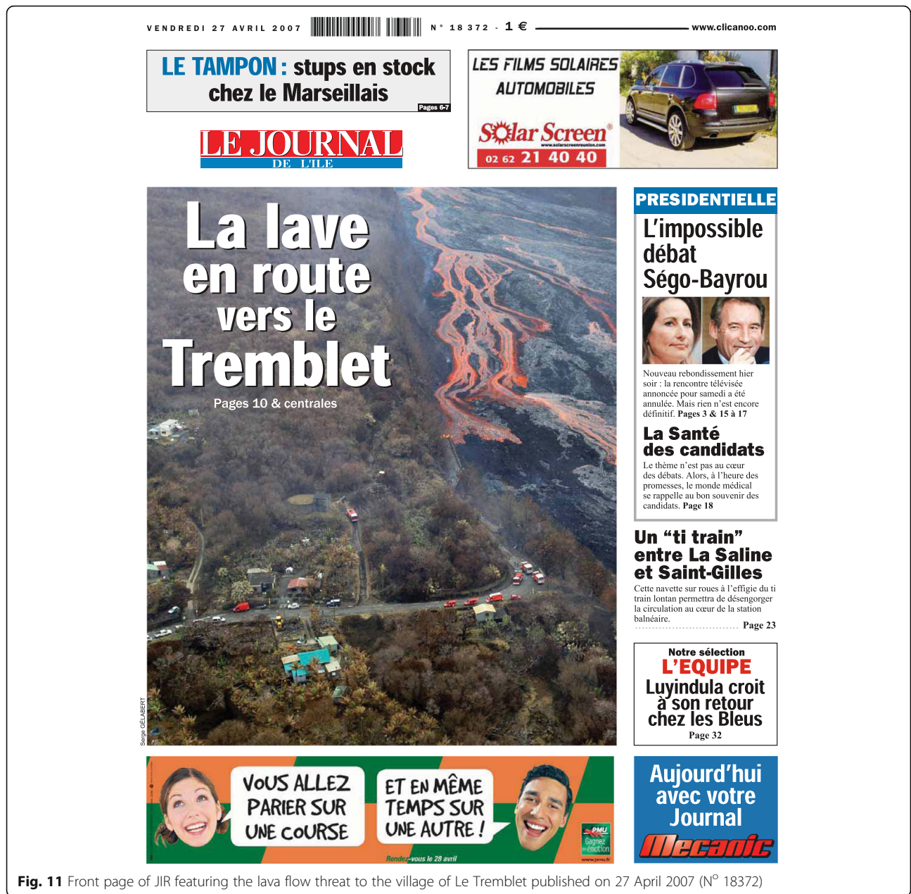
Fig. 11 Front page of JIR featuring the lava flow threat to the village of Le Tremblet published on 27 April 2007 (N° 18372)

there had been no experience of gas emission and impact amongst the population or the journalist; for lava flows, there had been—it was a known quantity for which there was experience and memory so that frame was an informed one that was not associated with “fear” or “panic”. All the same, advice regarding the gas and ash hazard was given in reports contained within the issues of 4 and 5 April, with further advice regarding health effects of sulfuric acid being provided by a lung specialist on 7 April. As we see next, the ash hazard was framed in a similar way, not being associated with the spectacle and sightseeing, but instead creating worry and uncertainty; worse “fear” and “panic”.