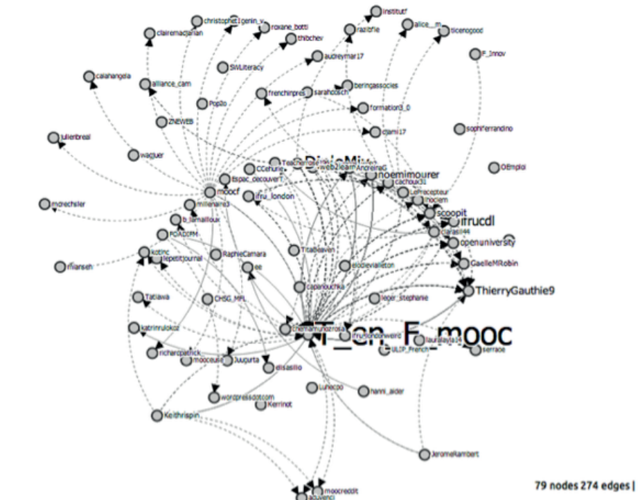
Figure 4.2: Data visualisation of the Twitter account

Additionally, it was observed that a high percentage of the MOOC content was retweeted through mobile platforms. We set up an API to track how information was disseminated through and between different users 7 (Figure 4.2).