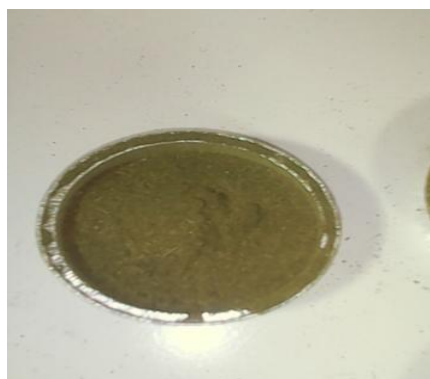
Fig. 2a. M. oleifera powder leaves unfermented

The fermentation of M. oleifera powder leaves is possible to increase the protein product due to increase of biomass; increasing the reducing sugar content due to the hydrolysis of complex sugars and phenolic compounds. Indeed phenolic compounds are abundant in the young stages of development of plants [16]; they reduce the onset of maturation and then become stable [17].