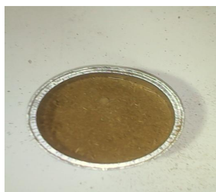
Fig. 2b. M. oleifera powder leaves fermented