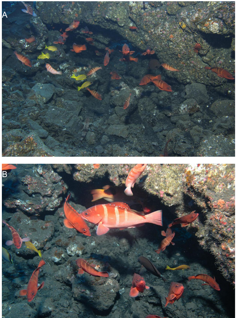
Fig. 3 Mass-settlement of Epinephelus oceanicus photographed on 25 May 2006 on the 2004 lava flow of the Piton de la Fournaise, Reunion Island. A, overview; B, detail

or on other Reunion coastal areas studied in numerous regional science programs (Pinault et al. 2013a).