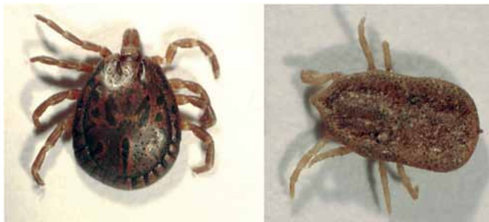
Figure 2. Amblyomma loculosum (left) and Carios capensis (right) ticks from seabird colonies on western Indian Ocean islands.

Partial sequencing was performed on the Rickettsia spp. gltA gene from 60 ticks, including ticks from each island and both species. Phylogenetic analyses revealed 7 haplotypes clustering in 4 well-supported clades; some of the haplotypes corresponded to previously described species (Figure 3). No association was found between Rickettsia spp. and collection location (island), but strong host (tick) specificity was observed (Figure 3). All A. loculosum ticks were infected with a Rickettsia strain showing 100% nt identity with the R. africae strain infecting A. loculosum ticks in New Caledonia and with the ESF-5 strain isolated from the cattle tick, A. variegatum , in Ethiopia (GenBank accession no. CP001612.1). Rickettsia spp. in C. capensis ticks had 3 well-supported genetic clusters and, thus, were more diverse. The most frequent Rickettsia sp. in these ticks (64% of the sequences) was a probable strain of R. hoogstraalii . Other haplotypes corresponded to an unknown Rickettsia sp. that was closely related to R. hoogstraalii and to a probable strain of R. bellii (28% and 8% of the sequences, respectively). The haplotype of R. bellii was detected only on Réunion Island in 2 C. capensis ticks collected within the same nest of the wedge-tailed shearwater ( Puffinus pacificus ).