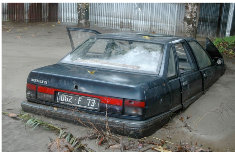
Figure 3a - Damage caused by mud flows (above) is compensated by advantages Figure 3b(below)

Meanwhile, environmental vulnerability is affected without the population being aware of it. The demand for sand was estimated at 121,953 cubic metres in 1997. Factories that crush lava materials cover only 52% of this demand, meaning that 57,587 cubic metres are provided by individual exploiters who use marine sand resource (Abdoulhalik and Hamidou Ali, 1998). Furthermore, the demand for sand has been increasing, due to a dense and anarchic urbanisation mainly along the coast, while the capacity of crushing stations remains limited. The illegal extraction of sand along coastal areas erodes beaches, limiting the number of safe anchoring points and disturbing coastal ecosystems. After 2005, people abandoned the extraction of coastal sand and engaged in river sand mining. After each heavy rainfall, dozens of people wait along the roads to gather the sand deposited by the volcanic hyperconcentrated flows. Coastal vulnerability has thus been reduced.