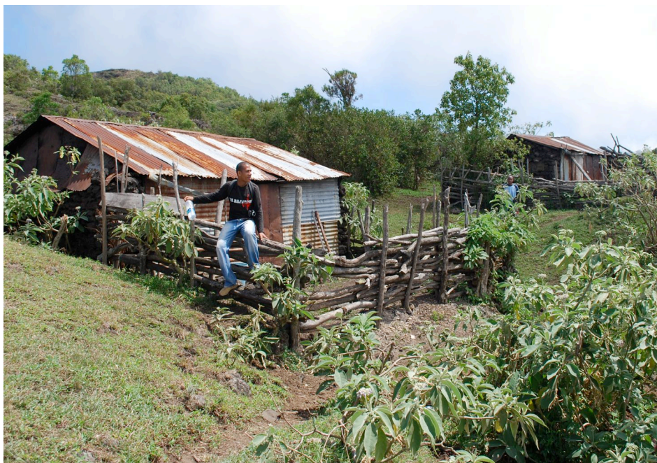
Figure 2 - Weak housing: Farmers have to live on the higher slopes of the volcano in order to access pastures due to local land use pressures.

The increase in Karthala's volcanic activity may decrease an aspect of vulnerability through well-developed awareness. Finally, one may ask if all deep-seated causes described above lie in the country's insularity. Pelling and Uitto (2001) and Kelman and Lewis (2005) show that small islands can be more vulnerable than other territories due to their small size, their relative inaccessibility, and their difficulties in maintaining adequate water and energy supplies and self-sufficient economies. That is, insularity can generate vulnerabilities. Lewis (1999) notes that even a small hazardous event can threaten an entire country in a small island context. However, some islands like Hawai'i deal well with volcanic hazards thanks to effective warning systems, emergency evacuation plans, land use planning and affluence (partly generated from mass tourism). Disasters (viewed as extensions of daily conditions, eg Hewitt, 1983; Maskrey, 1989) mainly affect geographically, socio-economically and/or politically marginalised people (Chester et al, 2002; Wisner et al, 2004). The great majority of Grande Comore's inhabitants are marginalised, with the main cause lying in the deep socio-economic crisis, itself linked to geographical and political constraints. Therefore, a volcanic eruption may lead to a disaster due to existing, prevalent vulnerabilities. In these conditions, how does the population deal with the threat?