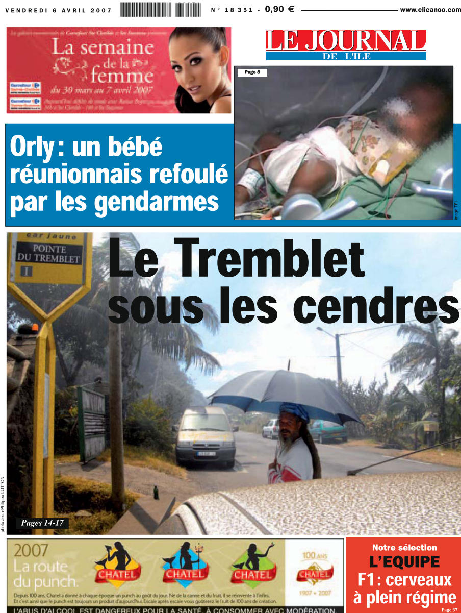
Fig. 13 Front page of JIR featuring the air fall hazard published on 6 April 2007 (N° 18351)

town center and my car was covered” (Leyral 2007c), embodied the problem of framing this hazard. That is, it was framed in terms of the victims, and not the responders or decision makers. Indeed definition of, and ad-hoc responses to, the air fall hazard were spontaneous and developed by those subject to the hazard. For example, Leyral (2007b) reported,