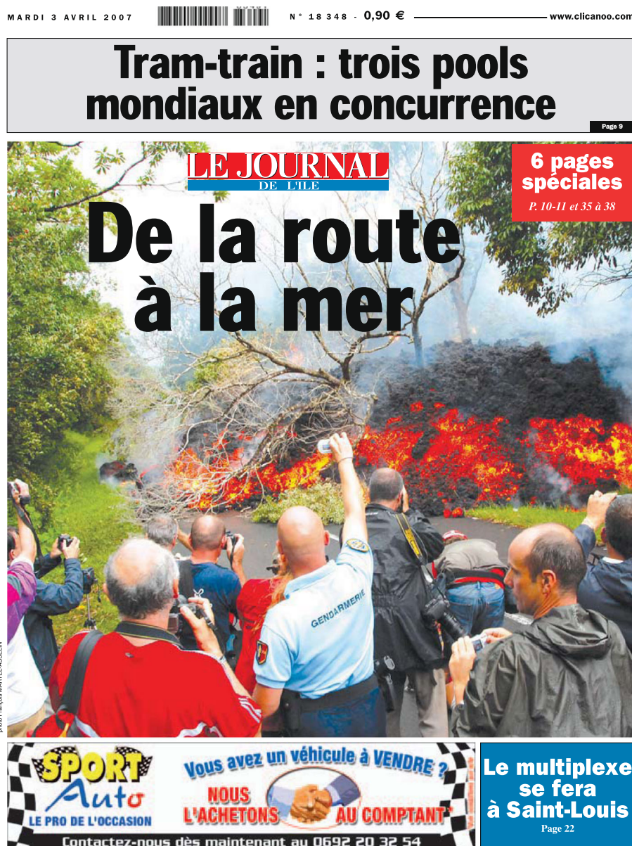
Fig. 5 Front page of JIR on 3 April 2007 (N° 18348). The onset of eruptive activity is announced with the headline “From the road to the sea”, with the reader being referred to an internal report, plus a four page photo montage (p. 35–38)

By number of front pages carrying volcanic hazard as the main theme, the collapse events of the Cratère Dolomieu