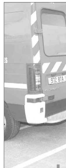
Entre le lycée Pierre-Poivre et les collèges Sang-Dragons et Joseph Hubert quatorze élèves ont été évacués vers l'hôpital par les secours.