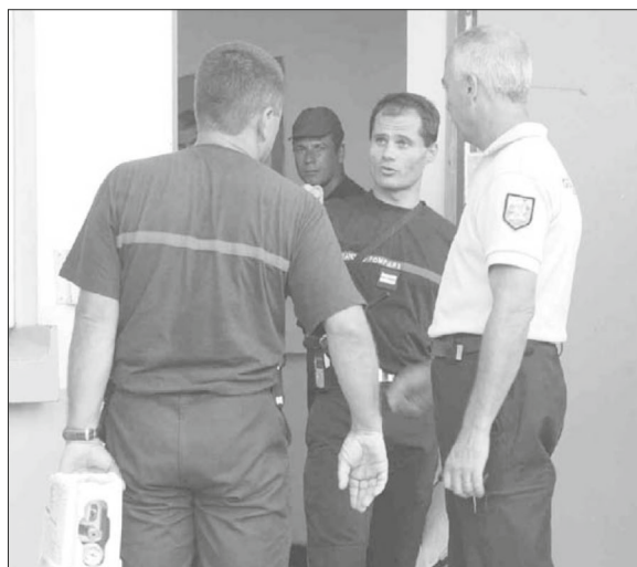
Pas moins de vingt-cinq pompiers de tout le Sud ont été mobilisés sur ce phénomène très localisé à Saint-Joseph.