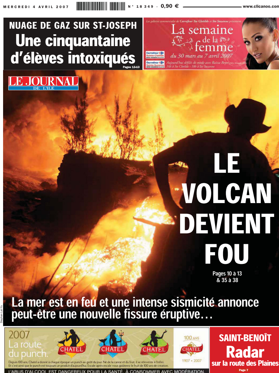
Fig. 6 Front page of JIR published on 4 April 2007 (N° 18349). A visitor watches lava entering the eruption under the title “the volcano’s gone mad”

featured most highly, being the main theme of six of the front page articles. Next was lava (five front page appearances), followed by gas and ocean entry hazards (two appearances), with seismic, ash and evacuation themes featuring on the front page just once (Table 1). However, if we complete a word count on all words appearing in all front page headlines of Table 1, we instead have the following ranking: