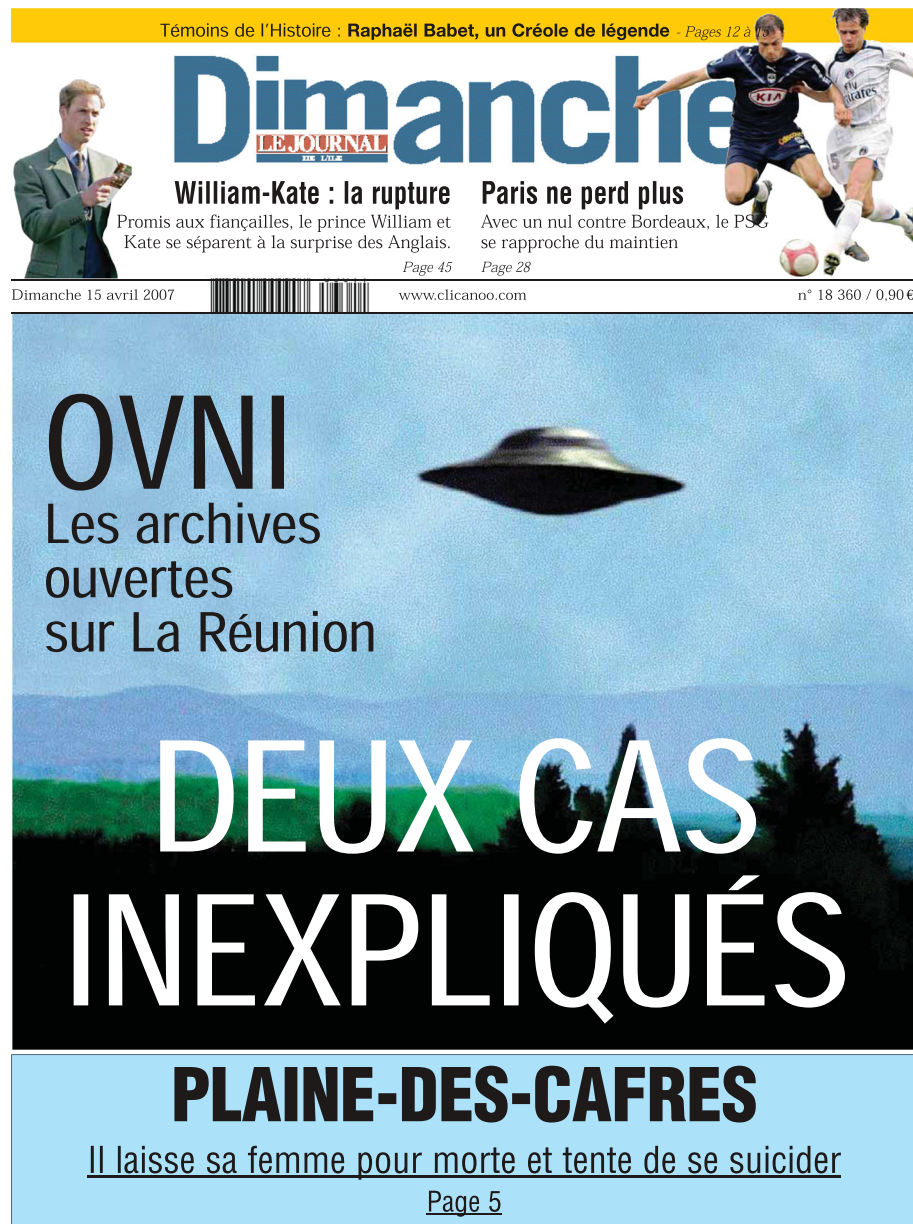
Fig. 1 Front page of JIR on 15 April 2007 (N° 18360) featuring a potential hazard (OVNI is French for Unidentified Flying Object—"UFO") not related to the natural hazard considered here, where this newspaper was published on day 13 of Piton de la Fournaise's April 2007 eruption

thereby framing the featured event (Reese 2010) and down-playing—through selecting and highlighting certain events over others (Entman 2004)—another (c.f. Figs. 1, 2 and 3). It is quite clear, for example, how the selection and use of images in the examples of Figs. 1, 2 and 3—all of which were published during the April 2007 eruption of Piton de la Fournaise—frame the natural hazard. In the case of Fig. 1 the event in which we are interested in communicating (the volcanic eruption and its hazard) has no presence and thereby goes unnoticed in spite of continued impact on communities in the SE of the island;