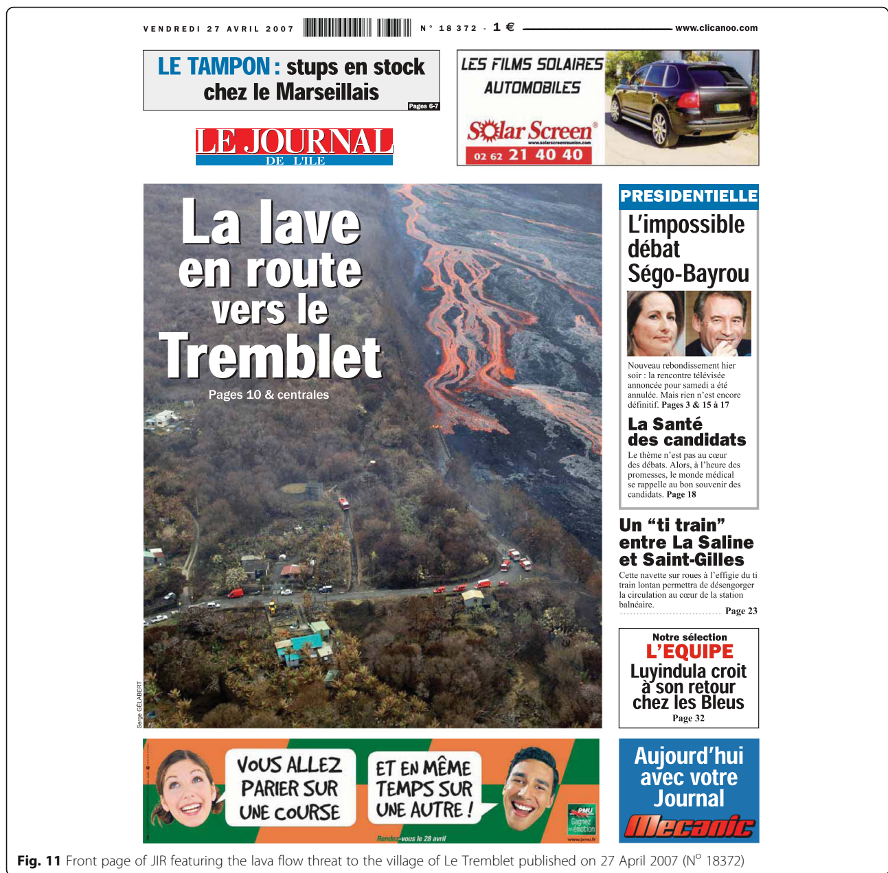
Fig. 11 Front page of JIR featuring the lava flow threat to the village of Le Tremblet published on 27 April 2007 (N° 18372)

there had been no experience of gas emission and impact amongst the population or the journalist; for lava flows, there had been—it was a known quantity for which there was experience and memory so that frame was an informed one that was not associated with “fear” or “panic”. All the same, advice regarding the gas and ash hazard was given in reports contained within the issues of 4 and 5 April, with further advice regarding health effects of sulfuric acid being provided by a lung specialist on 7 April. As we see next, the ash hazard was framed in a similar way, not being associated with the spectacle and sightseeing, but instead creating worry and uncertainty; worse “fear” and “panic”.