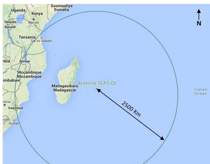
Figure 1: SEAS-OI acquisition circle

The SEAS-OI center and its IDS contribute to a larger project called GEODEV, which aims to increase the use and the competencies in Remote Sensing by sharing methodologies, tools and expertise through a network of similar structures. Besides SEAS-OI, this network under development, also includes GEOSUD and SEAS-Guyane.