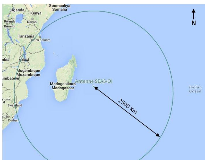
Figure 1: SEAS-OI acquisition circle

The SEAS-OI center and its IDS contribute to a larger project called GEODEV, which aims to increase the use and the competencies in Remote Sensing by sharing methodologies, tools and expertise through a network of similar structures. Besides SEAS-OI, this network under development, also includes GEOSUD and SEAS-Guyane.